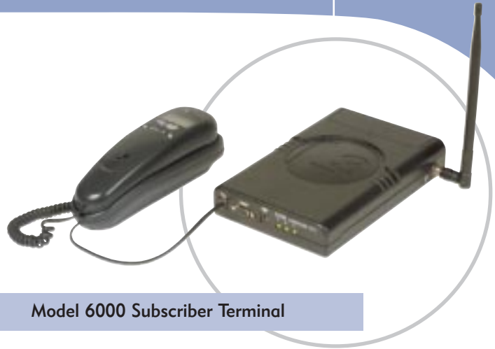
Model 6000 Subscriber Terminal

The Model 6000 Subscriber Terminal by L-3 Communications is a GSM/GPRS compatible subscriber terminal providing fixed wireless access for customers using standard GSM/GPRS mobile cellular networks. Suitable for a multitude of applications, the subscriber terminal allows the wireless service provider to maximize network utilization, minimize installation and maintenance times and increase subscriber penetration and revenues by supporting a full range of communications needs.